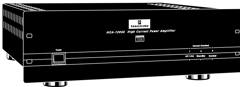
HCA-1203A Three Channel High Current Power Amplifier